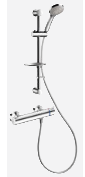
Shower kit with riser rail Ref. DELABIE: H9768KIT