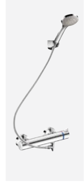
Shower kit with auto-draining device Ref. DELABIE: H9768HYG