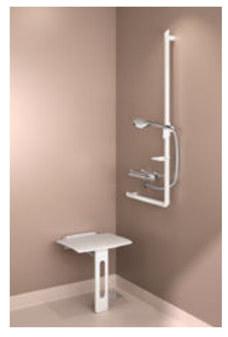
Lifestyle image: shower with H9768TP mixer Ref. DELABIE: DOUCHE HÉBERGEMENT H9768TP